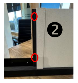
Install the first board as indicated in the installation guide and fix it to the building using Fiberwood screws.